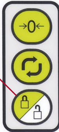
Hold/Release patient weight