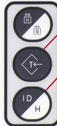
Up to 99 tares (optional)