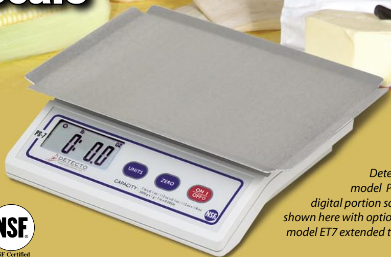
Detecto model PS-7 digital portion scale shown here with optional model ET7 extended tray.

Detecto's PS7 is Ideal for Restaurants, Cafeterias, Deli's, Pizza Parlors, and Food Service Professionals!