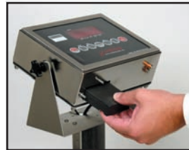
Optional battery allows the Nautilus to work anywhere!

Available in four capacities and featuring selectable key lockout, label printing, and adjustable filtering, the Nautilus is the most versatile wash down scale available.